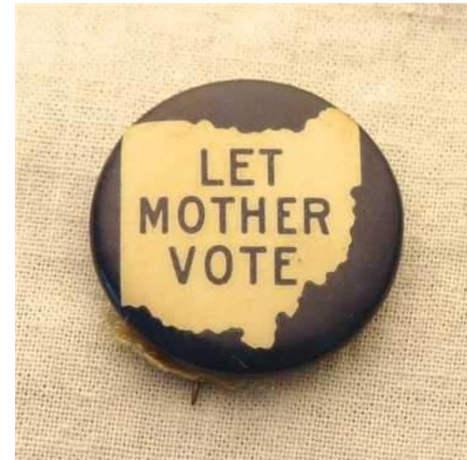
"Let Mother Vote" pin given out in 1911 by the Ohio Woman Suffrage Association.